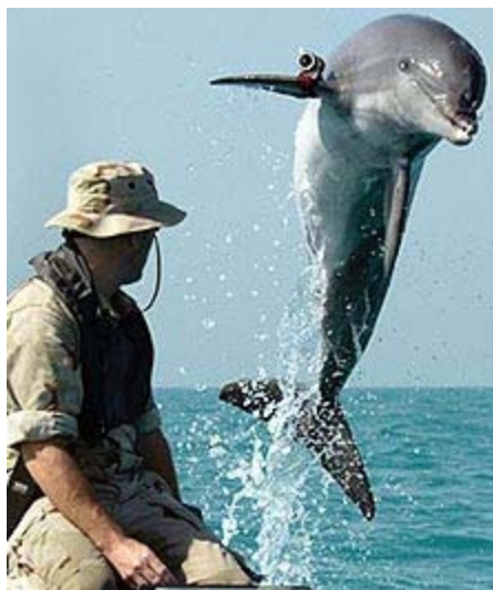
K-Dog, a bottlenose dolphin, has a camera attached to its flipper to record underwater objects. 2003.

This dolphin is helping soldiers. How? It looks for hidden objects on the ocean floor. Other animals help people too. Jump inside to learn all about them!